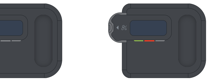
Second light red: Weak/no cellular First light red: BGM disconnected from cellular case — try re-inserting signal — move to a location with a stronger signal