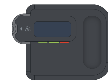
Third light red: Reading not sent (reasons can vary) — contact Omada support