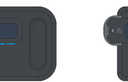
Three blue lights: Initial connection to Omada successful

How to read the 3 small lights on your connected BGM.